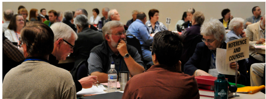
Reference and counsel committee hard at work

Those three workshops were just a sampling of the interesting options available to convention delegates and visitors.